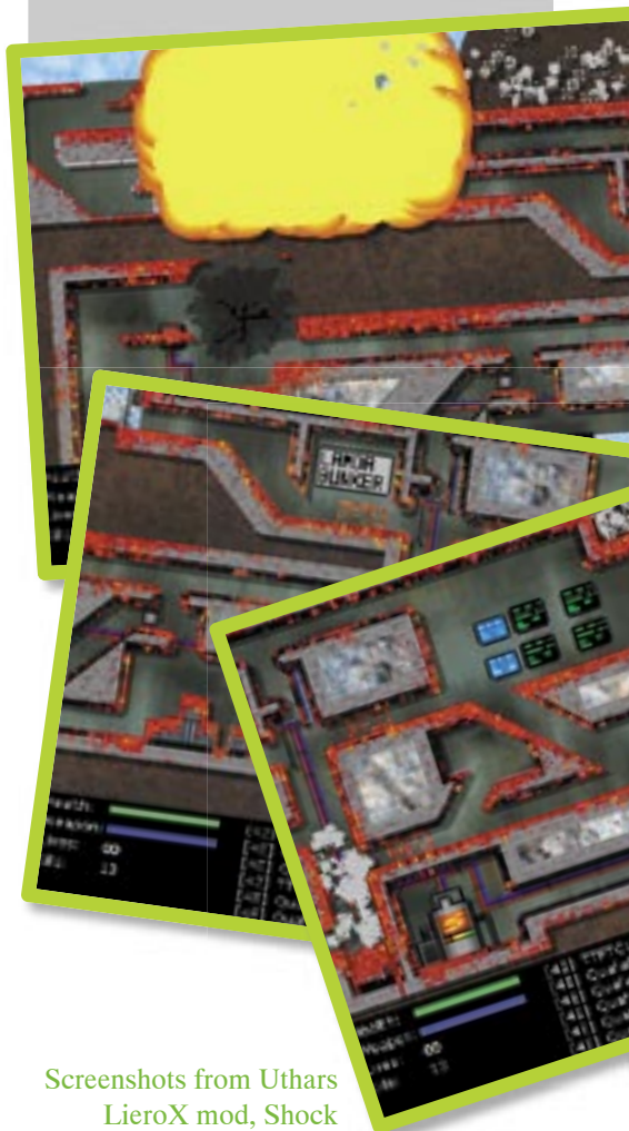
Screenshots from Uthars LieroX mod, Shock